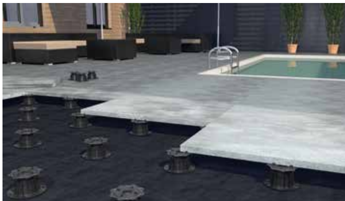
Der GIANT M installed beneath a stone terrace.

With integrated impact noise disc to absorb impact noise and a stone adapter for the individual support of stone slabs.