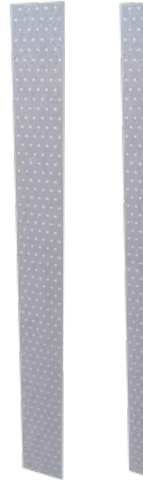
Perforated panel strips