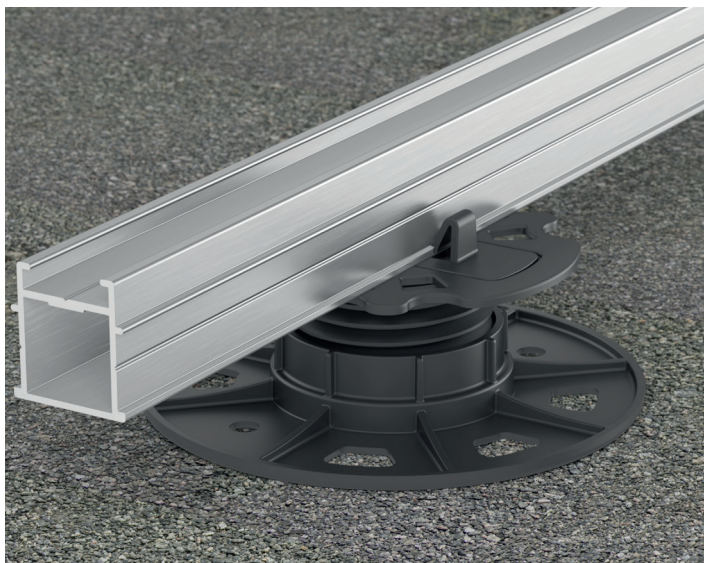
BASE adjustable pedestal with BASE Adapter 32 and EVO Light aluminium system profile