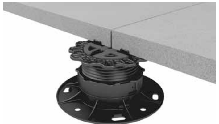
The Pro M adjustment pedestal with an impact plate and stone slab.