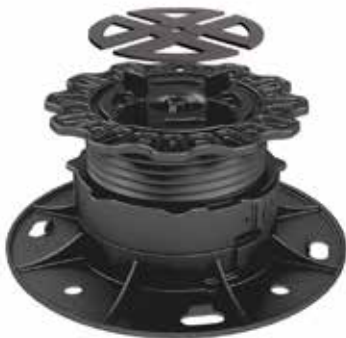
The PRO M adjustment pedestal with an impact plate.