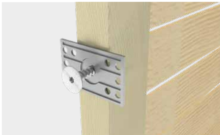
Mounting the wattle fence fitting set on a fence module