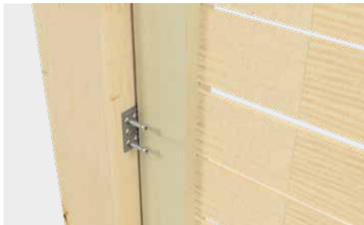
Subsequent mounting of the fence module on a fence post We recommend using 4 Clickyfix screws per fitting