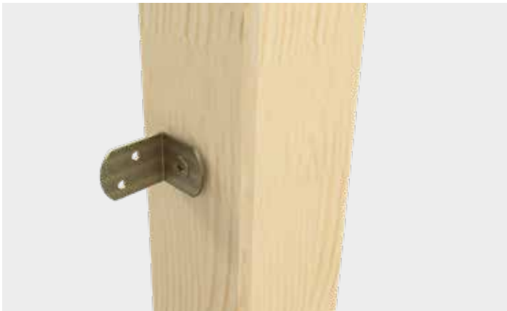
Fastening the bracket to the fence post