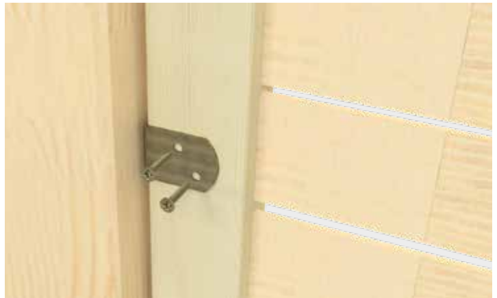
Subsequent assembly of the individual fence elements