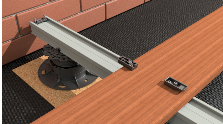
Insert element 1 into element 2. The terrace decking board is now fixed to the substructure.

2 Fix element 1 of the StarterClip to the bottom of the terrace decking board.