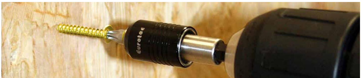
OSB Fix when screwing in