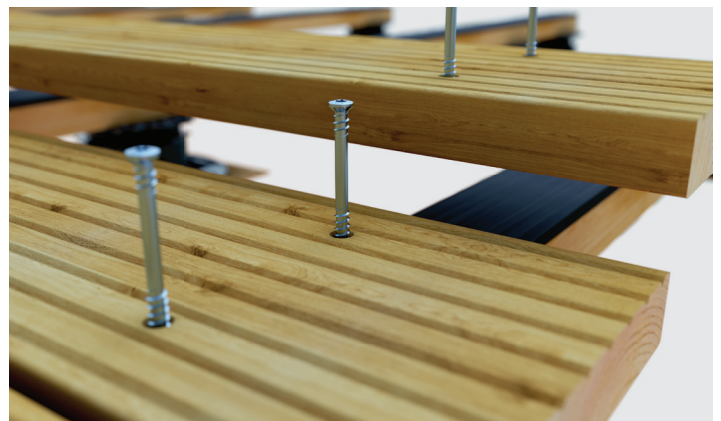
Sample application of the Terrasotec ornamental head in a decking board.