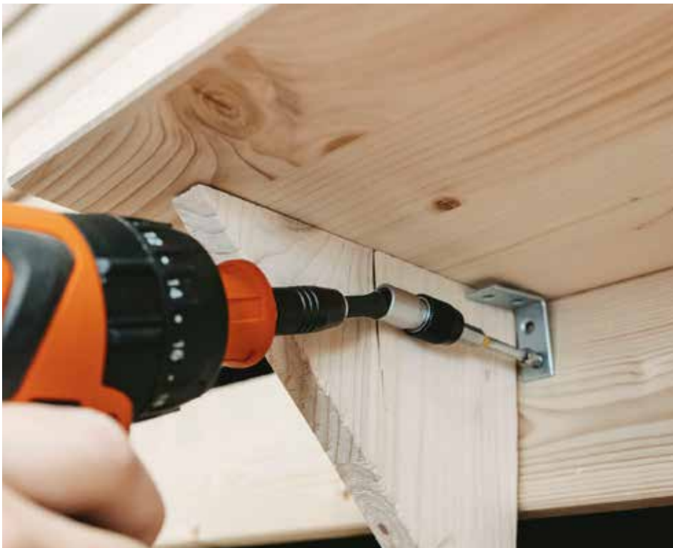
Sample usage: fastening a bracket in a hard-to-reach place using the swiveling bit holder.

© by E.u.r.o.Tec GmbH · Last updated 08/2021 · Subject to changes, additions, typesetting and printing errors.