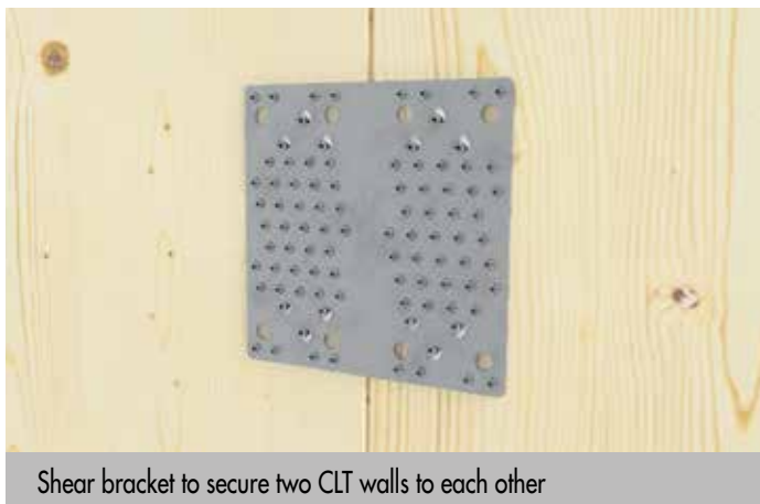
Shear bracket to secure two CLT walls to each other