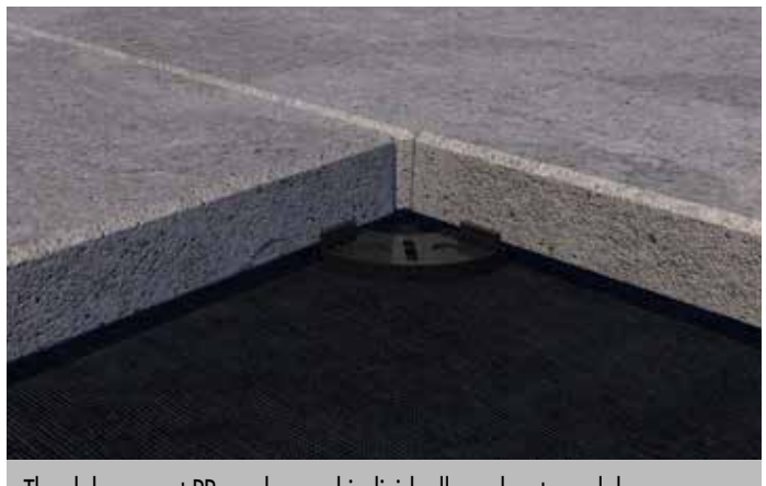
The slab support PP can be used individually under stone slabs ...