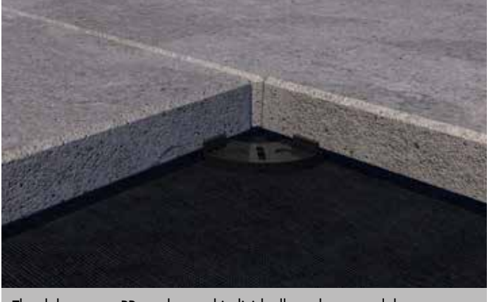
The slab support PP can be used individually under stone slabs ...